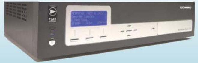
Overhead Music & Messaging

The Media Player also incorporates unique playback capabilities including random song shuffling and playback for added variety, consistent volume balance, and program rich mixing. This solution is a practical, high-performance digital music system that enables leading brands to extend the reach of their in-store and on hold experience for their customers.