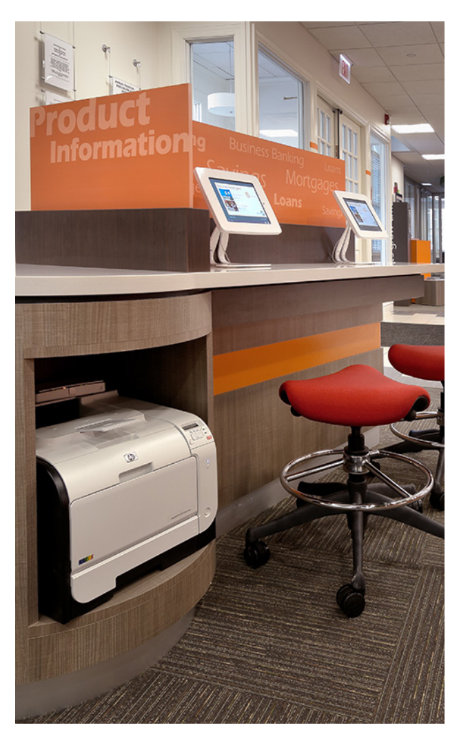
GETTING HANDS ON In addition to their video wall, Countryside Bank incorporated interactive tablet kiosks with an integrated queue to allow visitors to check in for appointments, then

learn about products and services at the touch of a finger.